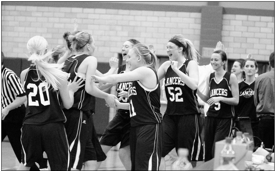
The Mount Marty College women's basketball team celebrates its 77-68 upset of fourth-ranked Morningside College in GPAC women's action Wednesday night in Sioux City, Iowa.