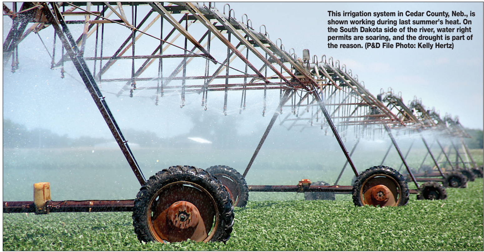
This irrigation system in Cedar County, Neb., is shown working during last summer's heat. On the South Dakota side of the river, water right permits are soaring, and the drought is part of the reason.