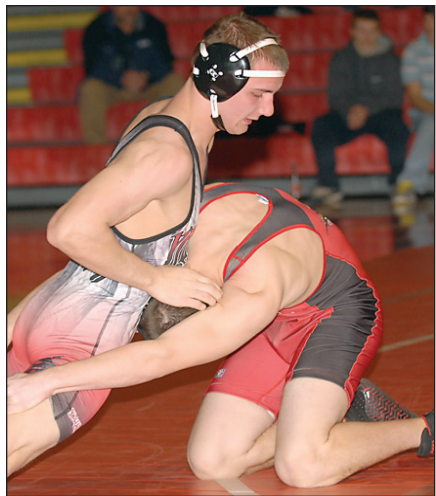
YHS Wrestlers Top Brandon Valley • 7