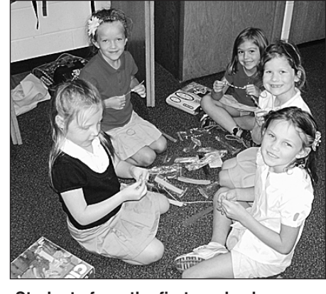
Students from the first grade classroom engaged in play and building activities.