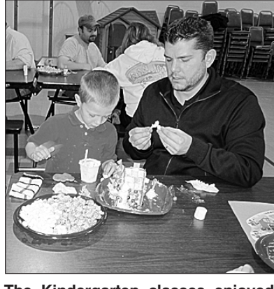
The Kindergarten classes enjoyed having their families come in to help them build gingerbread houses.