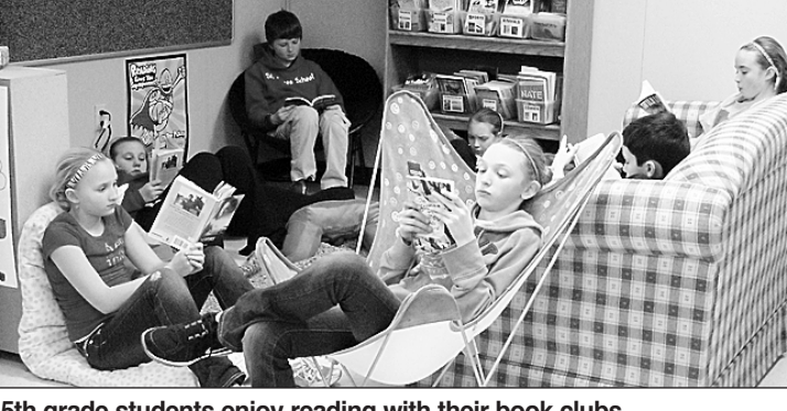
5th grade students enjoy reading with their book clubs.