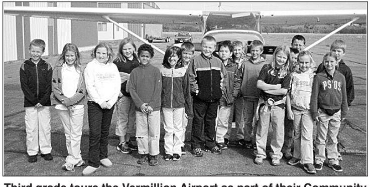
Third grade tours the Vermillion Airport as part of their Community Survey Program.

Mission Statement: The mission of St. Agnes School is to provide a Christ centered, compassionate community in which to educate our children's minds, hearts and spirits.