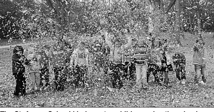
The St. Agnes School kindergarten children enjoy throwing leaves in the air during their visit to Cotton Park in the fall as part of their study of the seasons of the year.