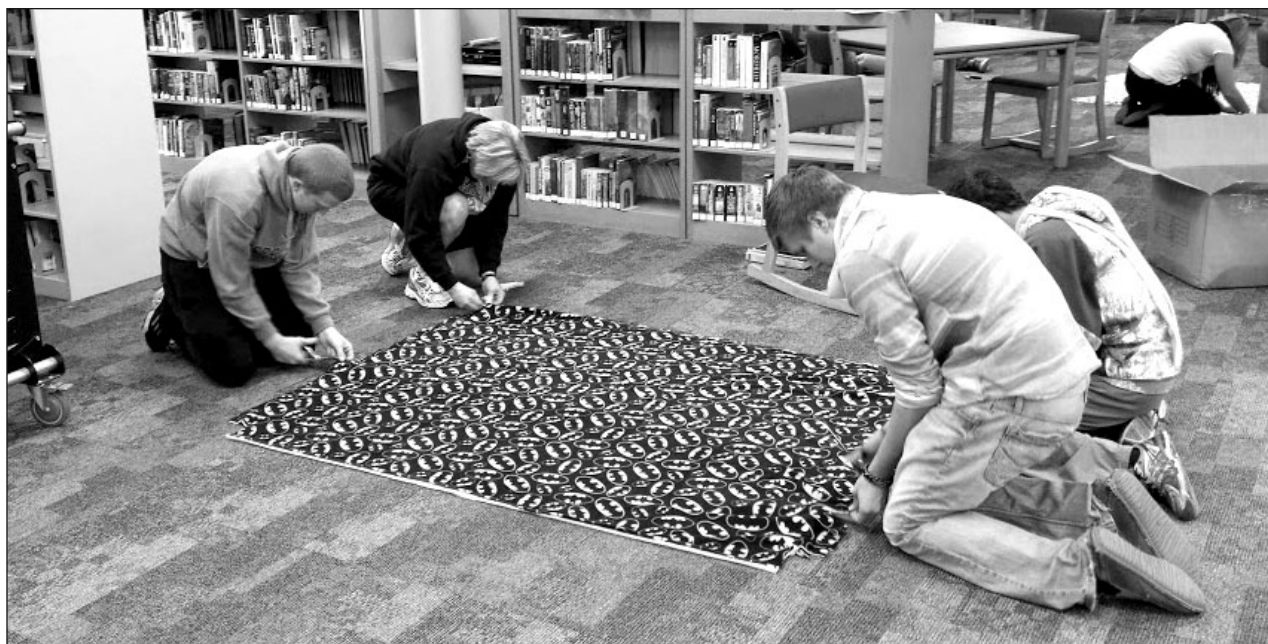
Yankton High School Student Council recently complete a community service project where they purchased fleece blanket materials and with the help of thirty students and several staff members we made 11 tied blankets in an hour. The blankets will be donated to the Yankton Women's Shelter. The idea for the project came from the annual State Student Council Conference where 500 students made 98 blankets and then donated them to different shelters throughout the state. YHS Student Council would like to make this an annual event that will hopefully grow.