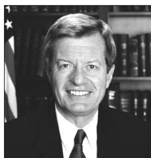
Sen. Max Baucus

Baucus said in a statement Wednesday that he is looking to follow in the footsteps of