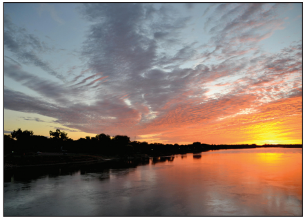
HAVE A PHOTO? Submit it to River City for publication in this space: RiverCity@yankton.net.