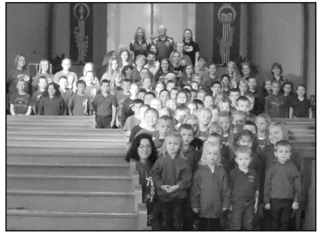
Our St. Rose School Student Body - Preschool and Grades 1-8

Their classroom leadership and temperament helps mold the minds and decisions of our students for the future.