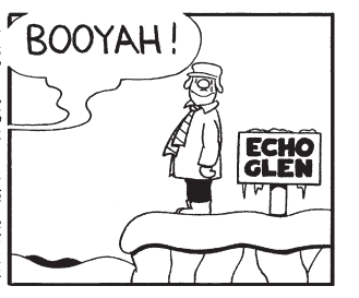
PEANUTS | CHARLES M. SCHULZ