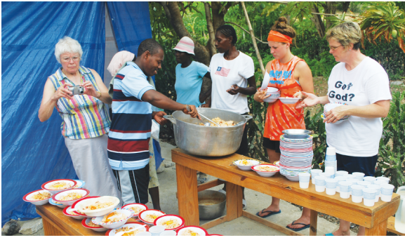
Team members served lunch to the Haitian people after Vacation Bible School.