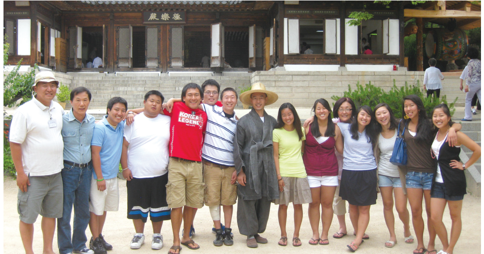
During their trip, the group had an overnight stay at the Gilsangsa temple. Pictured in the center is the monk who hosted them.