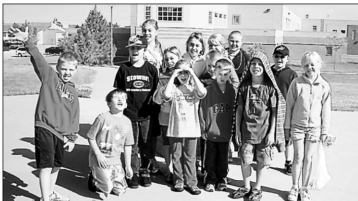
Thirty-one kids participated in the summer hiking program sponsored by Keep Yankton Beautiful. The group hiked around the Summit Center, did a mini Great American Cleanup, had a trash and recyclable objects treasure hunt, and the kids drew or wrote their vision of what the world would look like if people stopped focusing on litter reduction and recycling, and how it would look if that focus was continued. They also discussed why litter reduction and recycling are important to them and to the world.