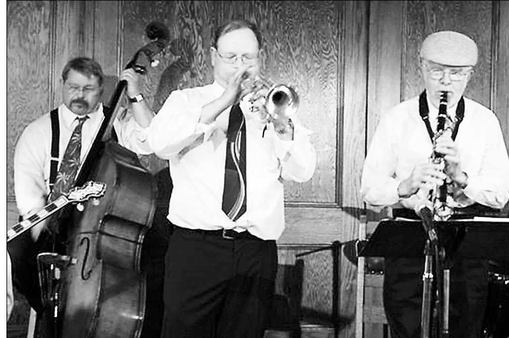
PHOTO: LITTLE CHICAGO SYNCOPATORS The Little Chicago Syncopators, shown here during its performance last week at Gayville Hall, will perform at the Riverside Park amphitheatre Tuesday as part of Yankton Area Arts' Summer Pops Concert series. This free performance starts at 8 p.m.