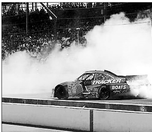
Jamie McMurray burns out after winning the Brickyard 400 Sunday afternoon.