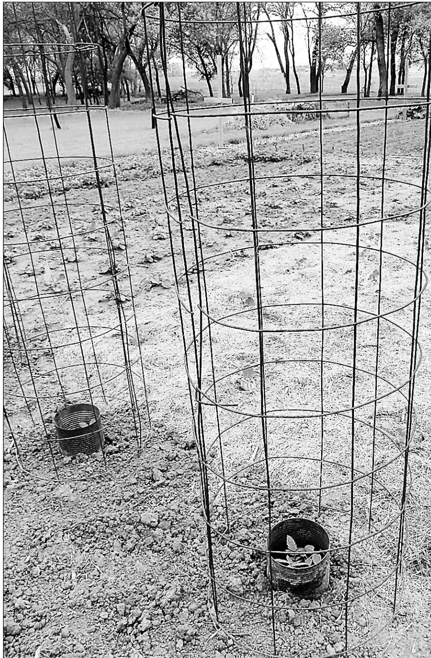
Brenda Reichle's cement reinforcement wire tomato cages are sturdy and take few steps to make. The bottomless can around each tomato plant blocks wind for new transplants and directs water to the roots for spot watering.

"The kids and I eat the peas off the vine. I'm trying 'Emerald Green' okra because my husband is from the south and likes it. We have kohlrabi, that midwestern