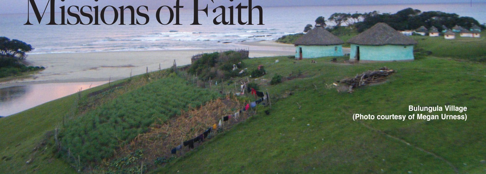
Bulungula Village