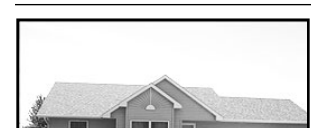
510 Linn * $70,900

3-bedroom, 2-bath ranch. Open floor plan, triple garage. Century 21 Kathy (605)661-0389.