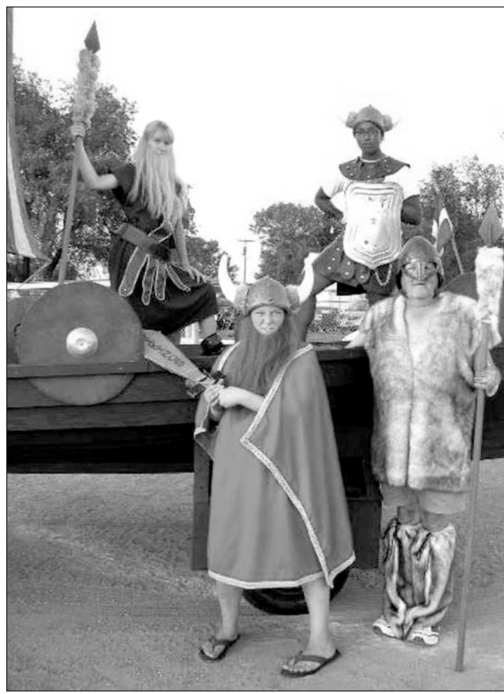
All manner of Vikings will be celebrating the area's Danish heritage at Viborg's annual Danish Days, set for this weekend in the Turner County community. The three-day festival begins today (Friday) and includes ethnic foods, entertainment, games and other attractions.