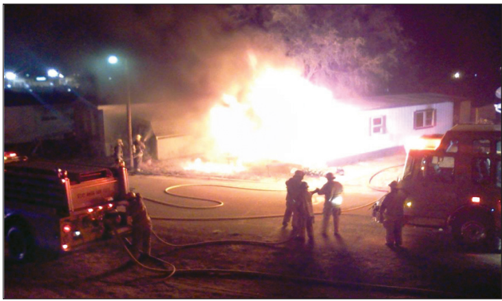
Yankton firefighters are shown battling a trailer home fire Friday night in the 2800 block of Broadway. No injuries were reported in the fire. The trailer was declared a total loss.

Anyone wishing to report anonymous information on unlawful activity in the City of Yankton or in Yankton County is encouraged to contact the Crime Stoppers tip line at 665-4440.