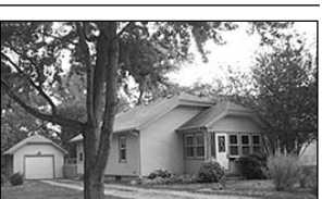
818 Linn • $84,000 New Listing