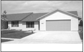
2817 Mary St.