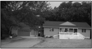
142 Frontier Lane $239,900

5-bedroom, 3-bath 6-miles west on Hwy. 50. Room inside and out. Call Lucy (605)665-2992 for more information or to view.