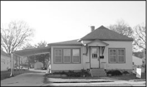
407 Pearl • $64,500

3 bedroom, main laundry. New paint & stain. Triple garage. Kathy (605)661-0389, Century21.