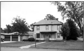
1100 Walnut $115,000

*Shopping For A Home? Lewis & Clark Board of Realtors Multiple Listing Service. www.yanktonrealtors.com