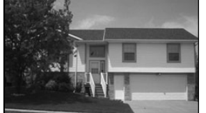
606 Augusta $159,900

506 Green $127,000 Open House Saturday, 8/3, 3pm-5pm Sunday, 8/4, 1-3pm (605)360-6689 www.yankton.net/506green/