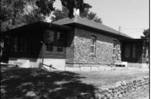
New Listing 410 W 8th St.