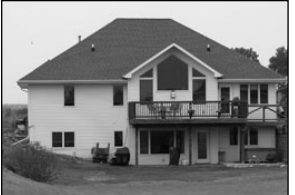
1405 River Aspen Rd.