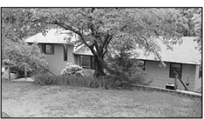
Lake Area Home!

Cute/clean 2-bedroom, 1-bath, many updates, 3-season room, fenced/deck/single garage. Leona Sparks, Anderson Realty LLC (605)660-6078.