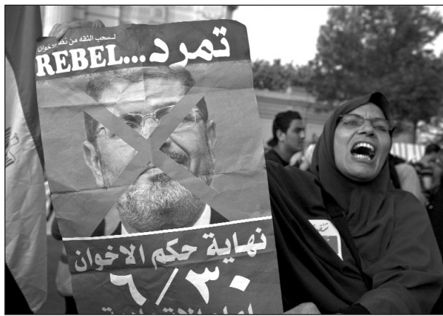
A woman holds up a defaced poster of President Mohamed Morsi outside the Al-Qobba Presidential Palace in Cairo, Egypt Tuesday night, July 2.

With tensions high, at least seven people were killed in three separate clashes between Morsi's supporters and opponents in Cairo, according to hospital and security officials, who spoke on condition of anonymity because they were not authorized to speak to the media. The officials did not give more details. The violence raised the overall death toll to 23 since Sunday when a mass protest was