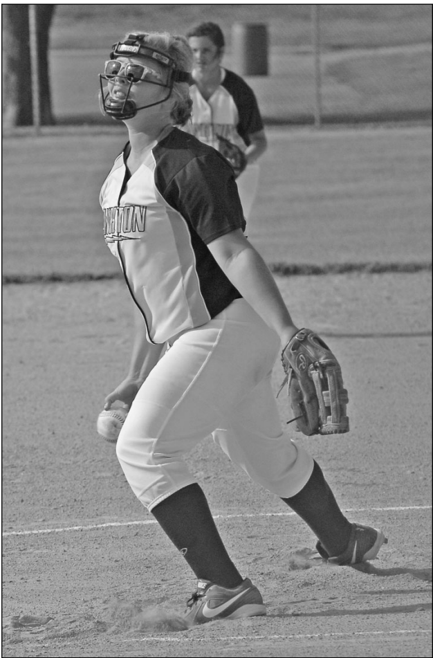
Three Yankton softball teams will be participating in the South Dakota ASA tournament in Sioux Falls on Friday. The tournament runs through Sunday.

Three teams from Yankton, as well as teams from other area communities, will send teams to the South Dakota Amateur Softball Association's State Girls' Fast-pitch Tournament, being held today (Friday) through Sunday at Sioux Falls' Sherman and Harmodon Parks. The Yankton Spitfire will compete in the 18-under 'A' division, with the Yankton Lightning in the 16-under 'A' division and the Yankton Fury in the 10-under 'B' east division. This marks the first year of a divided state girls' softball tournament, with 'B' division teams playing in Rapid City July 19-21. Yankton's Xtreme (14-under), Crush (12-under) and Shamrocks (12-under) will compete in that tournament. The 10-under 'B' division was divided so that teams could choose their preferred site, allowing them to cut down on travel for the event's youngest players. Besides the Yankton teams, area squads from Elk Point, Hurley, Jefferson, Lesterville, North Sioux City, Parkston, Platte, Scotland, Springfield, Tabor, Tripp, Tyndall, Vermillion and Wagner will participate in this weekend's event. (EDITOR'S NOTE: Other area communities may be represented by athletes playing in other communities, and by teams listed without a city.) Play begins early Friday afternoon, and continues until Sunday. Championship games in all divisions are