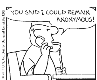
MOTHER GOOSE AND GRIMM | MIKE PETERS