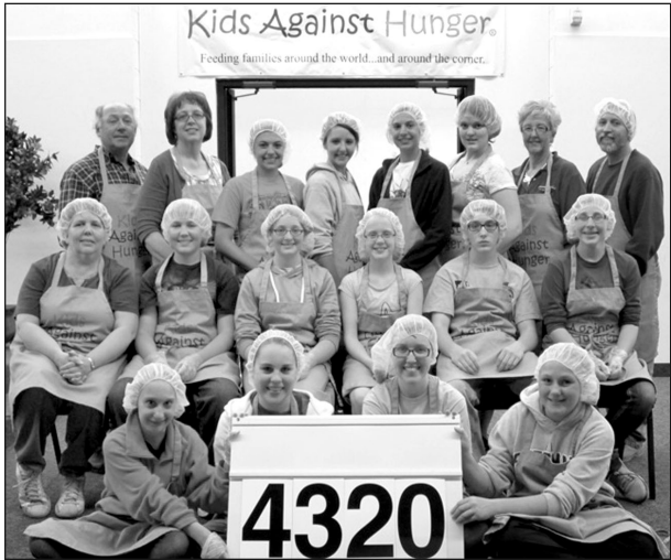
The Salem Mennonite Brethren Church senior high youth of Freeman/Bridgewater recently packed over 4300 meals for children in need of our care at Kids Against Hunger. If your church or youth group would like to learn more about how you can make a difference in the lives of children, please visit www.kahyankton.org .