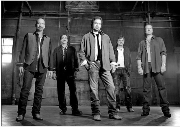
Restless Heart performs at the Cedar County Fair in Hartington, Neb., this Saturday night.