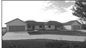
New Townhomes Just One Left! 631 Sawgrass Fox Run Golf Course 760-4712