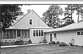
30358 448th Ave., Volin $172,500

For Sale by Owner: 4-bedroom, 3-bath, 2500+ sq.ft., 3-car garage. (605)665-7252 www.yankton.net/app/html/2607pine