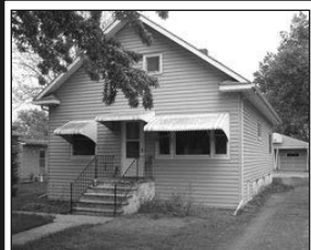
133 Vyborny • Tabor $52,500