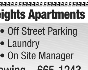
144 Acorn • $169,900

4-bedroom, 2-bath with lots of room. Joe (605)661-7264 America's Best Realty.