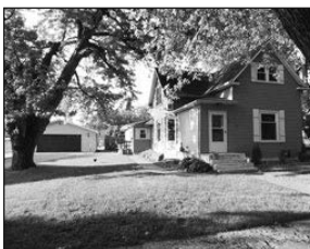
136 Turner • Irene $89,900