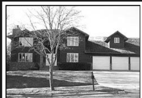
905 W. 13th St. $349,900

Gorgeous 5-bedroom home with original woodwork and hardwood floors, updated bathrooms and kitchen, and huge covered front porch. Ready for you to move right in! Ginny, Discovery Realty, LLC, (605)661-6031.