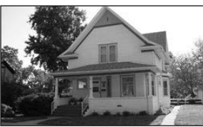
606 Capital • $135,900

3-bedroom, 1-bath, beautifully remodeled. 2-decks. Joe (605)661-7264 America's Best Realty.