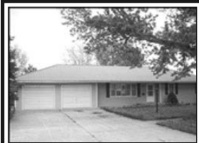
1009 1st St. • Crofton $99,900

Spacious 3+ bedroom, 2-bath on 1/3 acre in town. Lisa, Anderson Realty, LLC (605)661-0054.