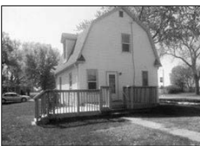
412 Brown • Gayville $72,000