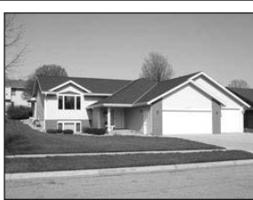
2607 Pine NEW PRICE: $250,000

4-bedroom, 2-bath, lake property. 3-season porches, deck, Joe (605)661-7264 America's Best Realty.