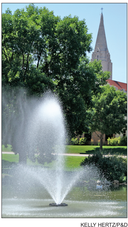
Keep Yankton Beautiful (KYB) and the City of Yankton have worked together to install a fountain in the pond at Westside Park. KYB raised $5,000 to cover its share of the project, which adds a new aesthetic quality to the park at all hours: The fountain is also illuminated by four lights during the nighttime hours (right). Besides providing a new artistic touch to the park area, the fountain should also assist in circulating the pond's water, which may help break down decaying vegetation, deter mosquito growth, and prevent surface and bottom