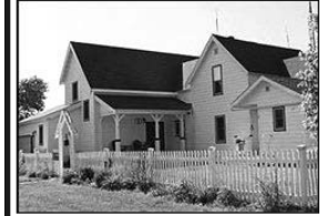
30542 433rd - Utica $409,900

3-bedroom, 2-bath, 3-car garage, 1/2 acre lot.