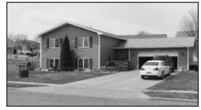
2803 Francis Price Reduced - $187,000