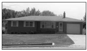
511 9th St. • Springfield $89,500

3-bedroom, 3-bath, 2-car detached garage, many updates. Joe, (605)661-7264, America's Best Realty.