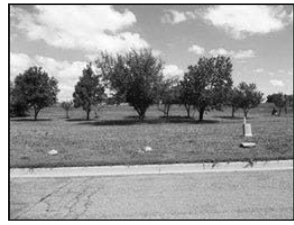
22nd St. Lot * Yankton $39,900

6-bedrooms, 3-baths, Newer windows/siding & roof. 1.63 acres. Joe, (605)661-7264, America's Best Realty.