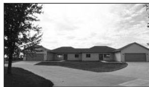
DeLuxe Townhome 631 Sawgrass #2

3-bedroom, 2-full bath, large garage, 5 minutes from lake. Listed at appraised value. Tom (605)660-1209, America's Best Realty.