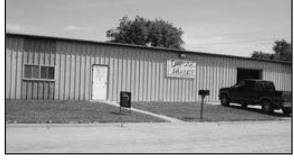
902 W. 19th

4,800 sq.ft. metal building, zoned industrial. Geo-thermal heating and cooling, 9' overhead door, 12' ceiling height. Offered at $190,000. Call Bill Bobzin, Broker, Century 21, (605)661-0148.