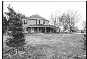
2200 Willowdale Rd. $179,000