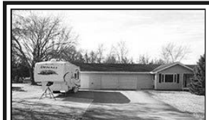
113 Richard (Riverside acres) $185,900

3-bedroom, 2-bath, 3-car garage, 1/2 acre lot.