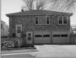
905 West 8th St. * $134,900

3-bedroom, nicely updated, large deck/backyard. Jolene, Century 21, (605)464-9634. 5119thStreetSpringfield.C21.com