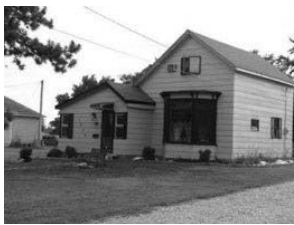
1208 Main St Tyndall Price Reduced $65,500

Joe, (605)661-7264 America's Best Realty