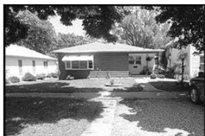
506 Green • $135,000

3-bedroom, 3-bath, 2-car detached garage, many updates. Joe, (605)661-7264, America's Best Realty.