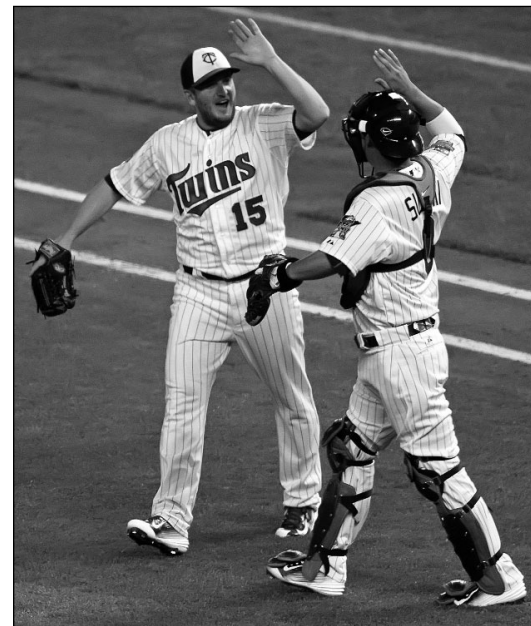
Minnesota Twins closer Glen Perkins, left, gets a high-five from catcher Kurt Suzuki after recording the save in a 5-3 win against the National League during the All-Star Game at Target Field in Minneapolis on Tuesday.