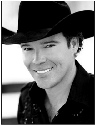
Country music star Clay Walker performs at the Knox County Fair in Bloomfield, Nebraska, Aug. 9.