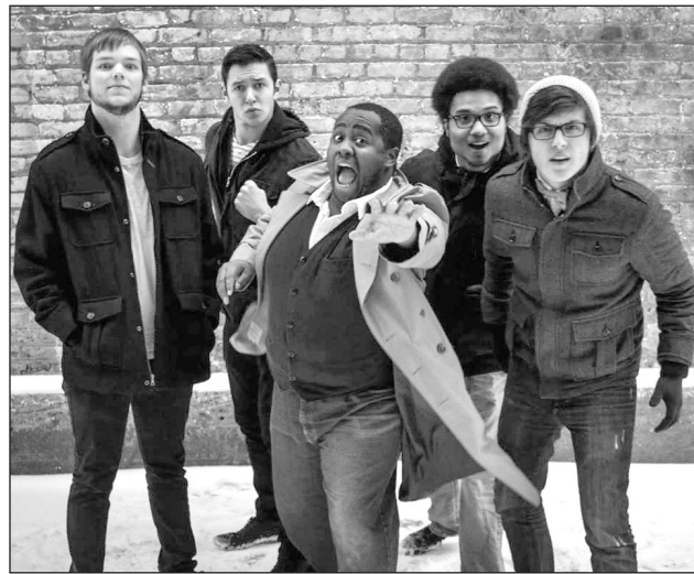
Saving Vinyl City (shown) and Livin' Free perform at the Riverside Park amphitheatre Saturday night as part of Yankton's Fourth of July festivities.