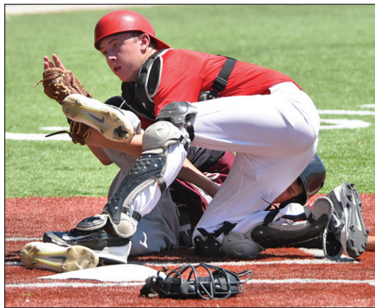
Yankton Lakers Swept By Brookings • 7