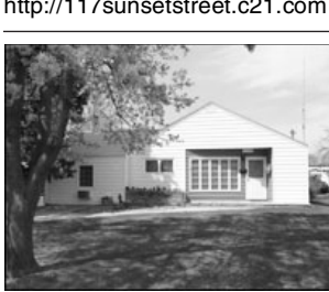
1501 Cedar $149,900

Very well maintained, 2-bedroom ranch. Jolene, Century 21, 605-464-9634. http://117sunsetstreet.c21.com