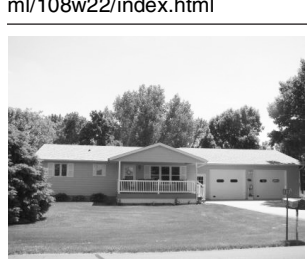
117 Sunset $157,500

Move in ready! 2-bedroom, 1bath, completely redone inside and out. 605-661-9319 605-463-2588. http://www.yankton.net/app/ht ml/108w22/index.html