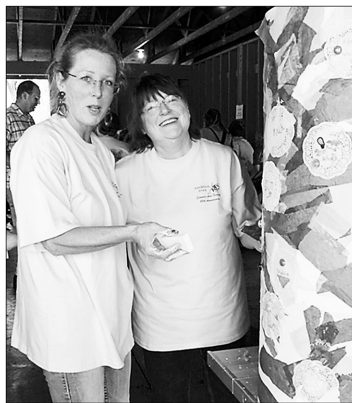
PAM MEYLOR/YANKTON AREA ARTS

The weather was perfect to inaugurate our Yankton Summer Band concert series. The all-