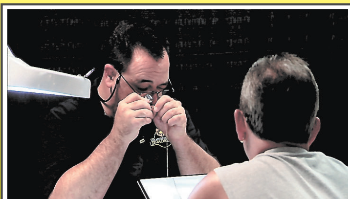
The Treasure Hunter's Roadshow event continues through Friday in Vermillion.