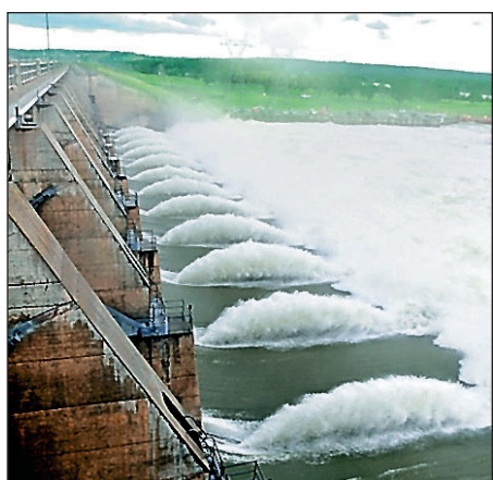
Water is shown rushing out of Gavins Point Dam (as seen from atop the spillway) Thursday afternoon. Releases from the dam are expected to climb to 150,000 cubic feet per second Tuesday.