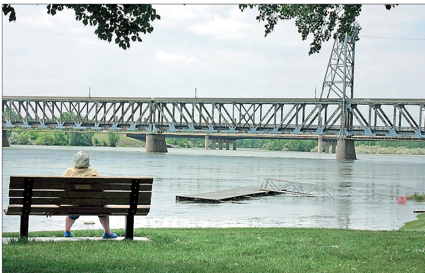
A woman in Yankton's Riverside Park Wednesday sits on a bench and watches the swollen Missouri River flowing by. The rising river has submerged a floating dock (pictured) and an ADA-accessible pier located at the southwest corner of the park. Based on current river projections, city officials believe the park will not go under water and that summer activities planned at the park can go on as planned.

"We just don't know when or where erosion may be happening, so when it comes to getting too close to