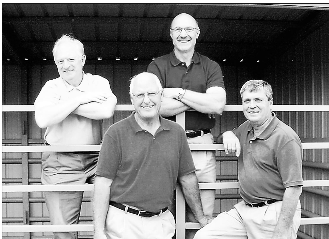
The Great Pretenders of Pipestone, Minn., will be the featured entertainment at the 142nd annual Midsommar festival at Dalesburg Lutheran Church in rural Vermillion June 24.

These books both empower the young chick to take action, something young children will thoroughly enjoy.