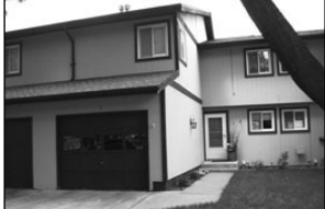
1307 Oakwood #3 $84,900

Country Acres Mobile Home Park. Extremely nice/clean 3-bedroom, stove, refrigerator. Water, sewer, garbage paid. Lease/deposit/references. No pets/smoking. $530/month includes lot.- may consider contract for deed. (605)660-2740.