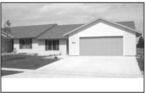
2817 Mary St.

Century 21 Professional Real Estate, Inc. 1701 Broadway, Yankton, SD 665-8970 • 1-800-210-1277 www.yanktonrealestate.com