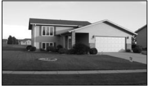
2510 Mulligan Dr. Price reduced $159,900

1705 West St. 3-bedroom, 2.5-bath Duplex Townhouse. 2-stall garage, screened deck $225,000. Owner financing. (605)661-9078