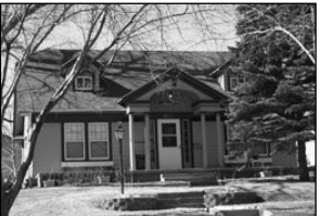
603 Maple • $114,900

Perfect acreage, 4-bedroom, 4.87 acres, hardwood floors, outbuildings, beautiful and move in ready. Call Erica (605)660-2992 Anderson Realty.