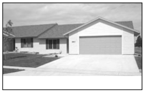
2817 Mary St.