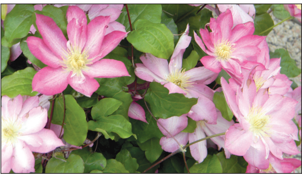
HAVE A PHOTO? Submit it to River City for publication in this space: RiverCity@yankton.net.