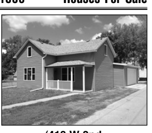
(418 W 2nd $129,900

J & V Storage, new 10x20 units. Call (605)668-0694 or (605)660-4115.