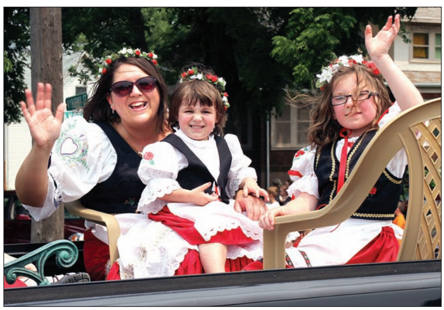
Tabor welcomed the world to town for its annual Czech Days celebration, which hit the ripe age of 65 this year. ABOVE: Many generations honored Tabor's ethnic tradition by wearing traditional ethnic attire, such as during Friday's parade. RIGHT: Czech Days opened with fire in the skies Thursday night during the annual Rich Schild Memorial Fireworks Display at the baseball diamond.