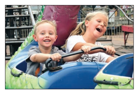
The carnival midway was a source of fun and thrills for Czech Days attendees of all ages. LEFT: These kids enjoyed a train ride on Friday afternoon. ABOVE: Meanwhile, these two young tractor operators enjoyed their ride on the midway Friday afternoon.