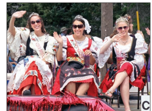
Czech Days is a celebration of old-world ethnic tradition and time-honored rituals that have come to define the annual summer festival. LEFT: A staple of the Czech Days tradition is the kolache, a fruit-filled pastry that an army of workers toil long hours to prepare. But an ample supply is always welcomed — and gobbled up — by Czech Days attendees. (Hertz) ABOVE LEFT: Another tradition is the performance of the Beseda Dancers in Sokol Park, featuring more than 200 dancers of all ages performing to live polka music. (Johnson) ABOVE RIGHT: The 65th anniversary of Czech Days brought back past Czech Days Queens, many of whom participated in Friday's parade. (Hertz)