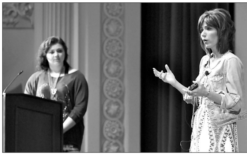
U.S. Rep. Kristi Noem responds to a South Dakota Girls State delegate's question. Noem addressed Tuesday morning's gathering of Girls State, held in Aalfs Auditorium on the University of South Dakota campus in Vermillion. The young women will meet on campus all week, with the 2014 session concluding late Saturday morning.

"I will tell you that leadership is about people," she said.