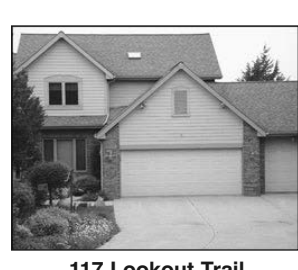
117 Lookout Trail Jim River Hideaway Mission Hill $459,900

http://www.yankton.net/117 case/index.html