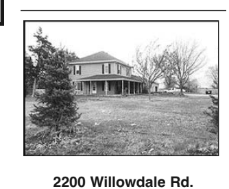
$179,000 6-bedrooms, 3-baths, Newer

windows/siding & roof. 1.63 acres. Joe, (605)661-7264, America's Best Realty.