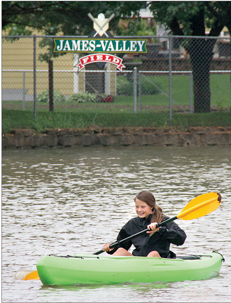
This girl, along with a friend, took advantage of the pool of water built up in this low area in the 2100 block of Peninah to do some kayaking Monday after nearly 4 inches of rain fell in Yankton. The girls said the water depth was 1-2 feet late in the morning, but had been deeper earlier.