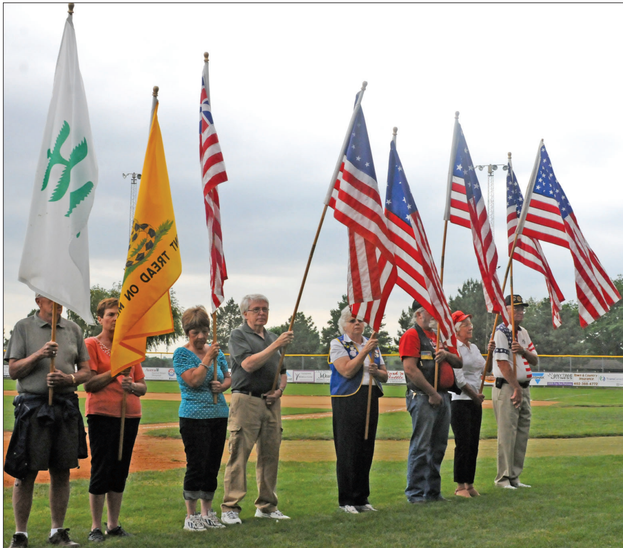
Members of Yankton Elks Lodge hold flags that have flown over the United States, including the current U.S. flag on the right, during a Flag Day ceremony at Riverside Field in Yankton. The ceremony was held in between games of the Bob Deery Classic VFW Teener baseball tournament on Saturday.