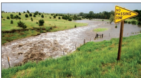
ABOVE: After a mostly dry spring, the Yankton area was hit with some big shots of rain, including this gully-washer that hit the northern part of Yankton County in June. Heavy rains and damaging storms afflicted several other parts of the region. RIGHT: This procession of the cross in honor of Good Friday was held in Yankton in April.