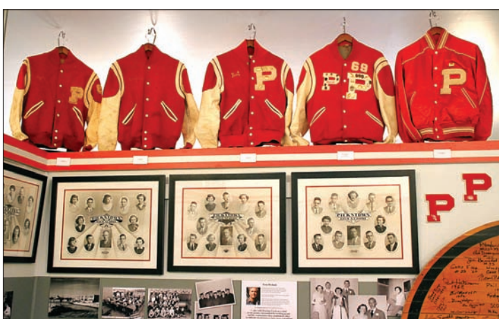
LEFT: The ghosts of athletic exploits' past were on display at the new Pickstown Fort Randall Museum, which was dedicated in June. (Hertz) To see or purchase photos taken by Press & Dakotan photographers, visit spotted.yankton.net .