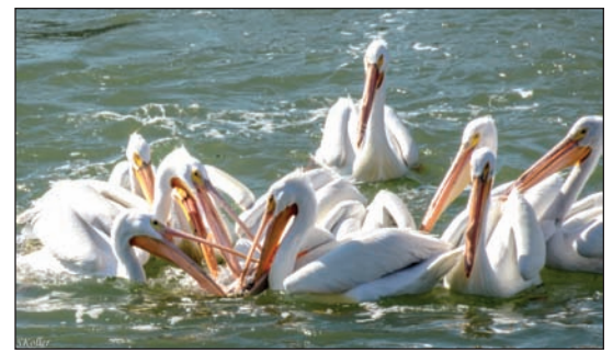
HAVE A PHOTO? Submit it to River City for publication in this space: RiverCity@yankton.net.