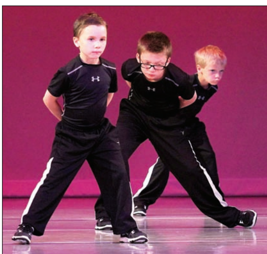
What's the spring season without a little dancing? Yankton's two dance studios provided plenty of that during their annual recitals. ABOVE: These boys with Yankton's Academy of Dance flash some moves during the studio's recital in May. The theme of the program was "Fairy Tales." RIGHT: These girls from the Green Room Dance Studio added a Spanish touch to their routine, part of the program "Come Sail Away."