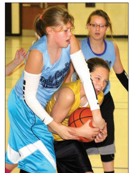
ABOVE: The area basketball season wrapped up with a flurry of action in the annual Roger Haas Memorial Basketball Tournament, held in Yankton in March.