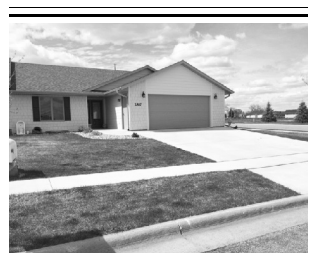
2817 Mary St. $264,900

Twin home built 2011. 1560 sq.ft. main floor, finished basement. 4-bedrooms, 3-baths. Beautiful floors, covered patio, appliances included. 605-660-5404.