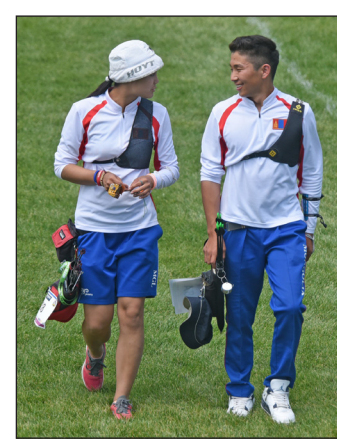
These Mongolian archers share a light moment during the Recurve Cadet Mixed Team matches Wednesday at the World Archery Youth Championships in Yankton.