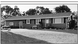
55465 Hwy 121, Crofton, NE $229,900

Twin home built 2011. 1560 sq.ft. main floor, finished basement. 4-bedrooms, 3-baths. Beautiful floors, covered patio, appliances included. 605-660-5404. http://www.yankton.net/app/ht/ml/2817maryst/index.html