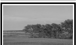
Lots in Running Water, SD

Imagine 2015 mobile home set up in court in Yankton, Vermilion or Beresford. Contract for deed at wholesale price. $6,000 down, we'll finance, roughly $400/month plus lot rent. Why rent? Start owning now. Stop making your landlord rich. This is a no brainer, call now, Nationwide Homes 605-665-0822.