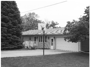
211 E. 16 th • Tyndall Reduced $104,900

3-bedroom, 2-bath ranch, many updates! Jolene, Century 21, 605-464-9634.