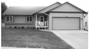
104 E. Francis St. $199,900

3+-bedroom, 2-1/2 bath with attached garage, 2,772 sq.ft. Lower level with walk-out. 8,712 sq.ft. lot. Call/text Dan/Bridget 605-760-0740 or 605-760-0149. http://www.yankton.net/app/ht/ml/1008w14th