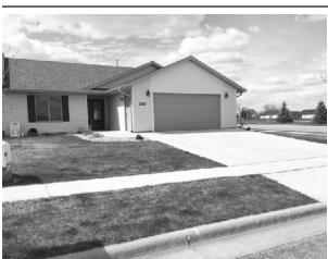
2817 Mary St. $264,900

3-bedroom, 2-bath ranch, many updates! Jolene, Century 21, 605-464-9634.