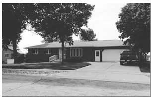
1008 W. 14 th $194,500

Completely updated split level. 3+bedrooms, 1-3/4 bath. Lower level family room with walk-out to garage, beautiful landscaping, corner lot. 605-661-6267. http://www.yankton.net/app/ht/ml/1007dakota/