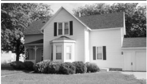
204 Brown St., Gayville For Sale by Owner $135,900