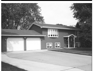
1007 Dakota St. $174,900

Yankton Simple Storage Several units available. No long term contracts. Affordable rents. Call 605-661-6439.