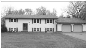
116 Cottonwood • $188,500

4-bedroom, 3-bath home located in a quiet neighborhood. Open floor plan with vaulted ceilings throughout home. Contact Trevor 605-660-5404. http://www.yankton.net/app/ht/ml/104efrancis/index.html