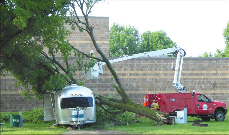
Strong winds early Monday morning brought down this tree in Vermillion. High winds also caused considerable damage in the Sioux Falls area.

SIOUX FALLS — Violent thunderstorms early Monday caused damage throughout eastern South Dakota, leaving thousands of people without power and zeroing in on the town of Garretson, where damage was particularly extensive. Winds downed trees and power poles in the town 10 miles northeast of Sioux Falls, blew over four tanks at a fertilizer plant, and led to a gas leak that prompted the evacuation of a mobile home park. Several homes were damaged but no injuries were reported. The Red Cross was providing help. The National Weather Service sent a survey team to Garretson to investigate whether straight-line winds or a tornado caused the damage, the Argus Leader newspaper reported. "We have several houses — five that I've seen myself — that have roofs missing or severe damage," Fire Chief J.R. Hofer told KSFY-TV. "There are trees down all over town." Resident Paul Linneweber told the Argus Leader that he and his wife were getting